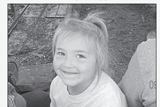
Her smile says it all!