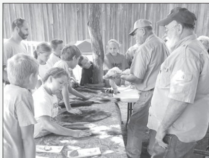
Children listen intently at the fur trappers' display table.