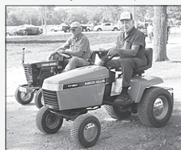
These guys are at every show!